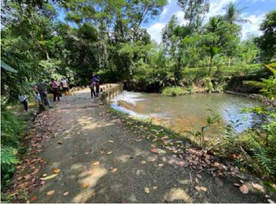
From LB Side