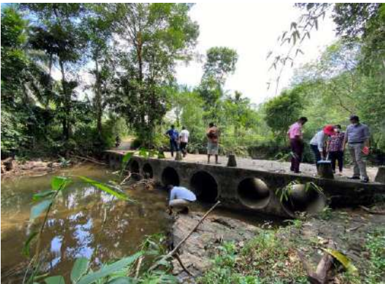
From U/S Side