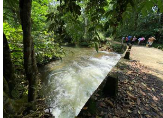
From D/S Side