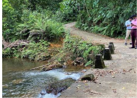
From RB Side