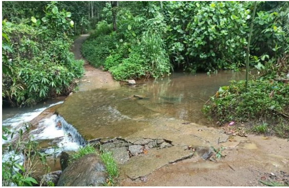
From LB Side LB- Aluthwewa