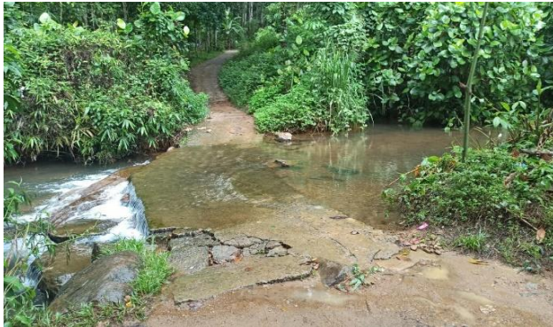
From D/S Side