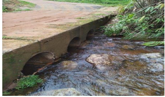
From RB Side RB - 112 E dikellakanda