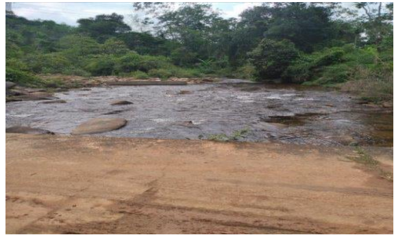
From D/S Side