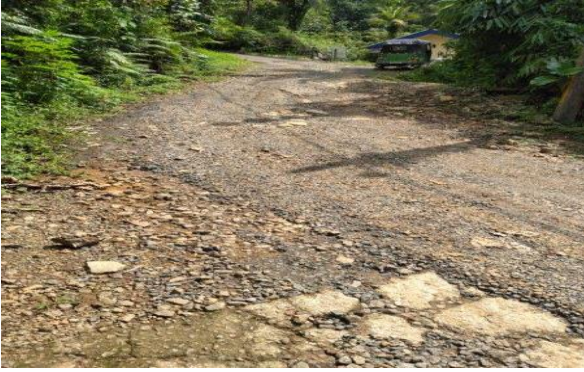
From LB Side LB- 112 E dikellakanda