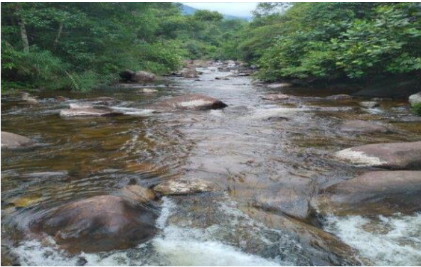
From U/S Side