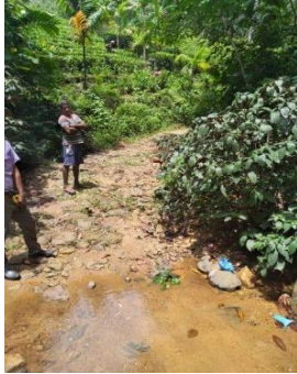
From LB Side LB- Murekanda