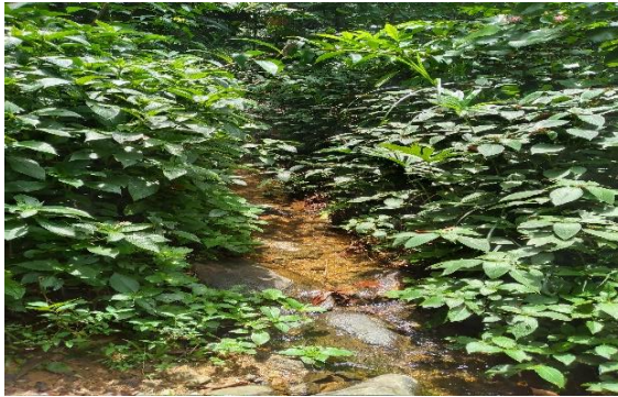
From U/S Side

District – Kegalle DS Division – Daraniyagala