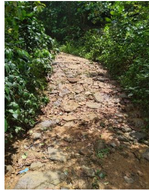
From RB Side RB - Kosgahahinna